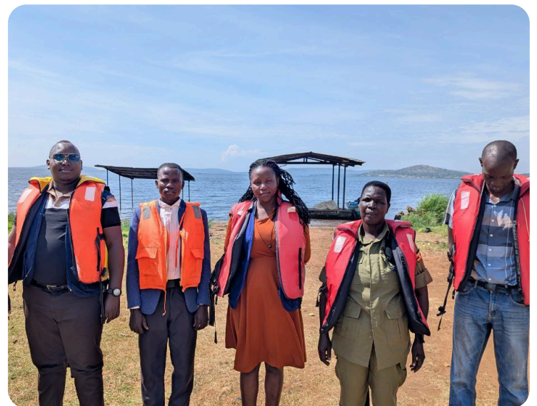
UGANET's Legal Aid and Advocacy teams conducts a week long Mobile Aid Camp in Namayingo district

Lolwe Island and surrounding fishing communities in Namayingo District face compounded structural barriers to accessing HIV services, emergency healthcare, and justice mechanisms. Geographic isolation and the highly mobile nature of fishing-related economic activities significantly disrupt continuity of care for People Living with HIV.