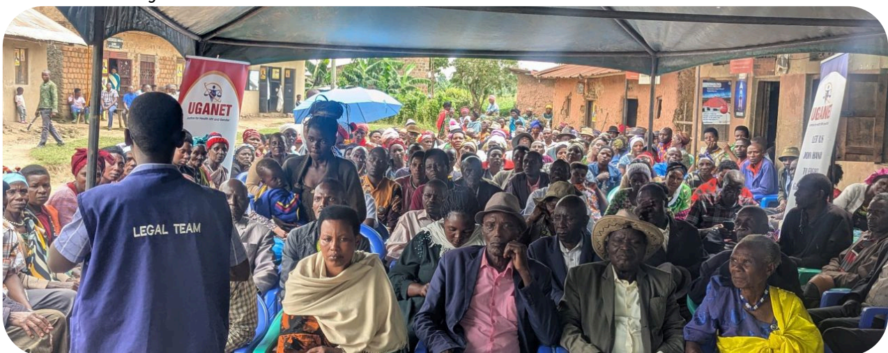
UGANET's Legal Aid team conducts a week long Mobile Aid Camp in Kisoro district

By situating legal services within health facilities, the Beam Light Model operationalizes statutory protections in a setting where rights violations may first surface. Health–legal integration therefore strengthens accountability within both systems.