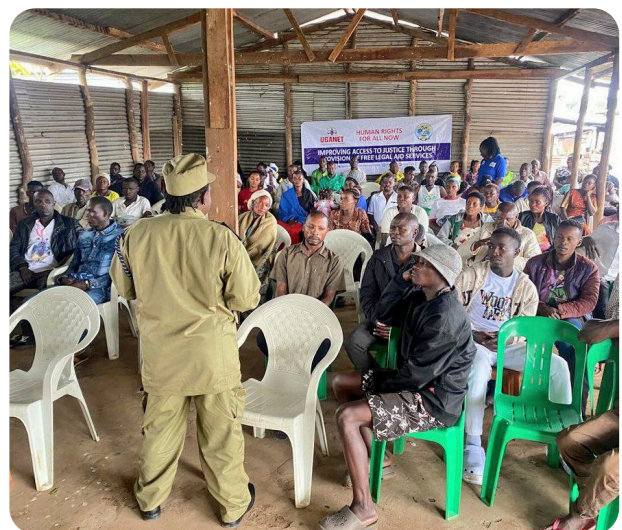
UGANET's Legal Aid team conducts a week long Mobile Aid Camp in Kalangala district