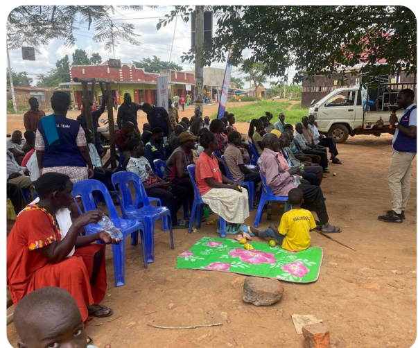
UGANET's Legal Aid team conducts a week long Mobile Aid Camp in Buliisa district